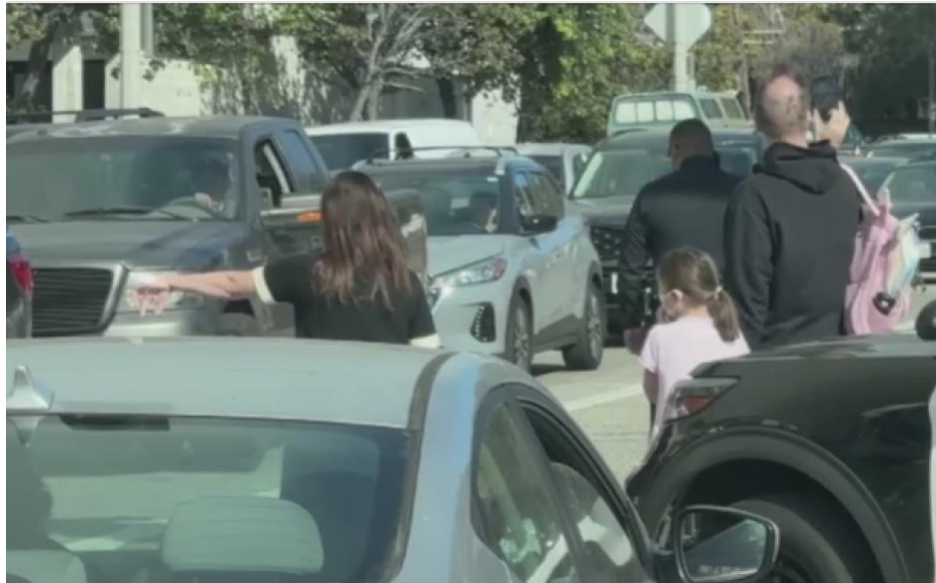
Image 4: Residents abandon their cars and attempt to flee the fire area on foot as the Pacific Coast Highway and other thoroughfares are closed (Wenzke, 2025).