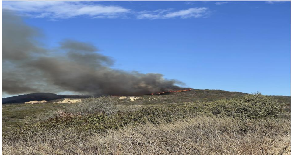
Image 1: Early stages of the Palisades Fire, with dry brush tinder visible in the foreground ( Margolis, 2025 ).