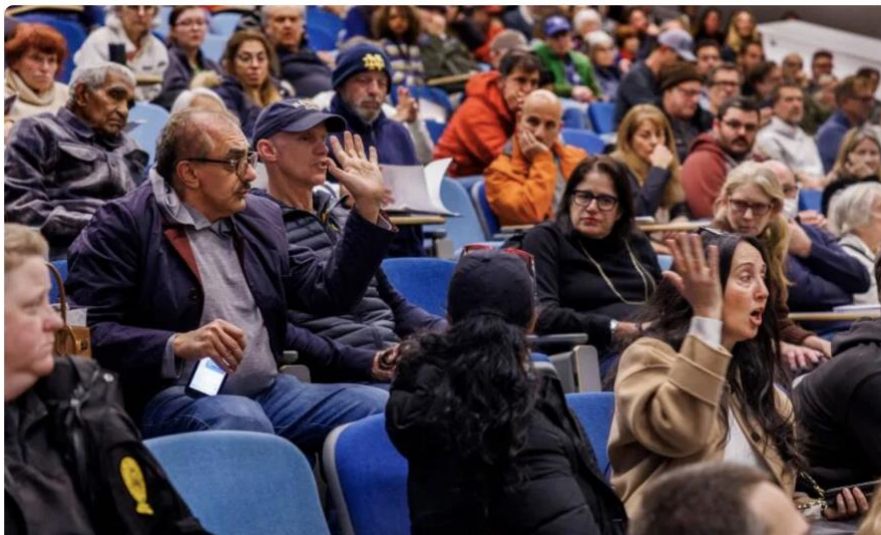
Image 6: Pacific Palisades residents voiced frustrations during a January 26, 2025, town hall on debris removal at Santa Monica College (Smith, 2025).

Town halls in Santa Monica and elsewhere in the county drew hundreds of residents voicing outrage at the slow emergency response and lack of post-fire support. Local and state officials faced questions on water access, evacuation timelines, and insurance denial issues ( Smith, 2025 ).