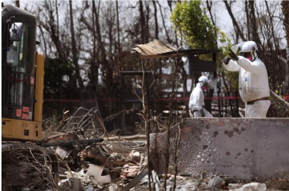
Image 7: Workers remove debris from a home destroyed in the Palisades fire, under the supervision of the Army Corps of Engineers (Briscoe et al., 2025).