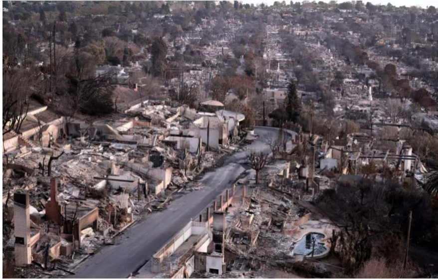
Image 5: Residents returned to ruined homes in the Pacific Palisades, January 2025 (Campa et al., 2025).