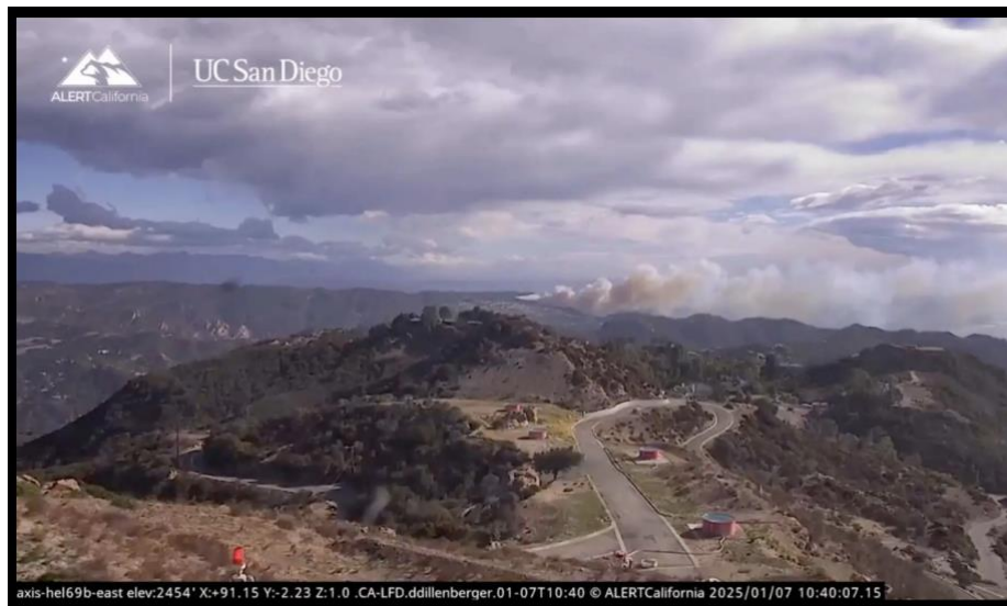
Image 2: The above image shows the early stages of the Palisades fire on January 7, 2025, within minutes of its official start (Nesi & Kennedy, 2025).